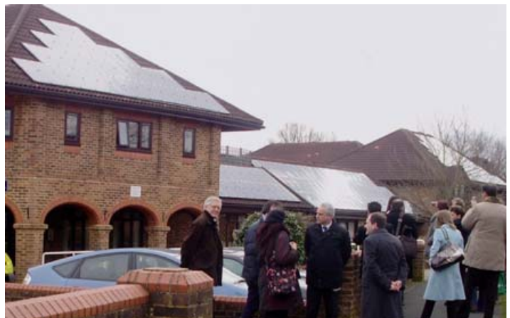
Visiting Brockhill Retirement Village in Woking, which has been fitted with photo-voltaic panels.

For more information, visit: http://www.iclei-europe.org/sustainable-now .