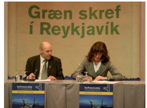
Ministers Halldórsdóttir and Sigfússon, Iceland, signing the Action Plan

The financial crisis has hit Reykjavik hard but the city is now forging ahead, using sustainable purchasing as a sound basis for a sound future, proving to be an excellent host city for EcoProcura 2009 and its focus. Over 220 representatives from local governments, national governments and other public sector bodies spent three inspiring and intensive days discussing how sustainable public purchasing practices can make a substantial contribution to climate change mitigation and adaptation. It was all the more fitting when the host nation seized the opportunity to allow delegates to witness the official signing of a new Icelandic sustainable procurement National Action Plan by the Ministers of the Environment and Finance.