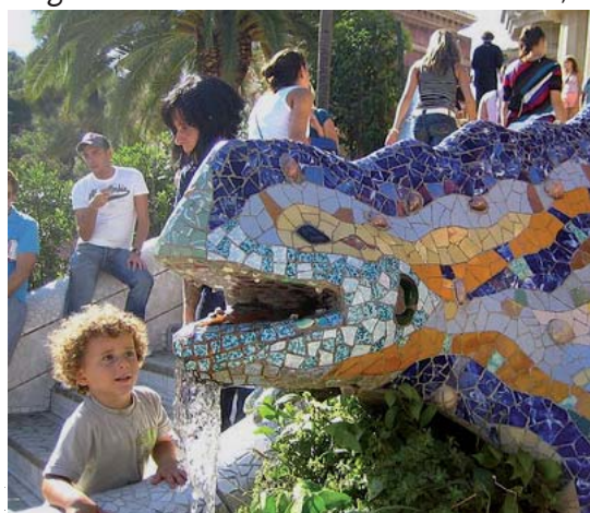
Water feature in Barcelona’s famous Parc Güell

While concerns about impacts of climate change on water resources and management systems are growing, ICLEI assists its members in bringing their concerns and needs to the attention of higher levels of government. This has been realised, for example, through ICLEI’s collaboration in the drafting and