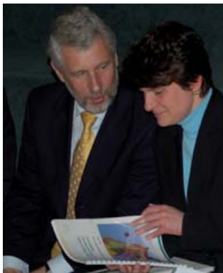
Baden-Württemberg Environment Minister, Tanja Gönner, reviews the European Secretariat's Sustainability Report

There has been a gradual replacement of older computer monitors with ergonomically and environmentally improved LCD displays, while lighting systems are now 99 percent within energy efficiency category A. The majority of office materials were already environmentally friendly, but paper used for faxes has now been switched to the environmentally friendly Blue Angel label.