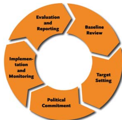
ICLEI’s Sustainability Cycle

ICLEI’s Governance and Management team has not only been involved in supporting these cities and towns in their introduction of locally adapted management systems. At the ‘Netzwerk21’ congresses in 2007 and 2008, annual conventions of German local governments and civil society organisations active in Local Agenda 21 and other local sustainability processes, ICLEI’s presentations of the ‘Sustainability Cycle’ received much recognition and generated a high level of interest.