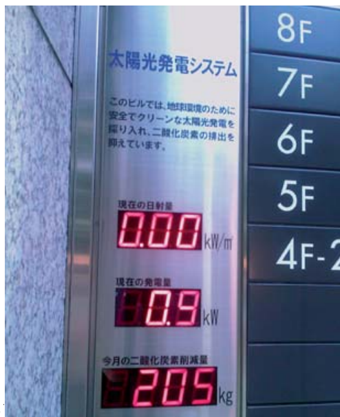
Solar information panel in a Japanese building