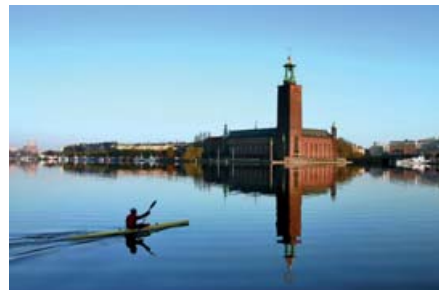
Stockholm City Hall

The City of Stockholm (Sweden) , one of the most advanced and ambitious in climate protection, has been very supportive of the CCP Campaign and hosted the European Climate Conference in 2006. It was then that climate change adaptation was added to the range of ICLEI themes, with the conference proving to be an excellent launch platform. Building on this today is the 'Working Group on Adaptation', where information is shared to support learning and capacity development.