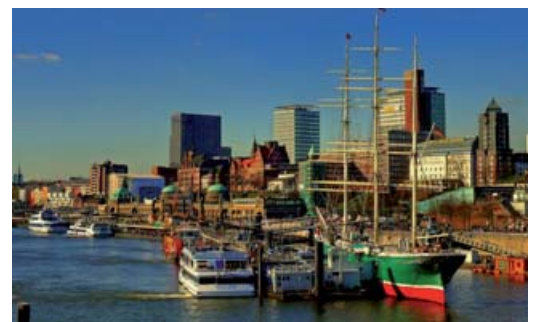
Harbour city Hamburg