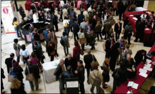
Delegates register for Sevilla 2007

This commitment has been confirmed by the Fifth European Conference on Sustainable Cities and Towns, Sevilla 2007 –Taking the Commitments to the streets, which ran from 21-24 March 2007. Not only was the conference the biggest ever of its kind. It has also been the first that was accomplished solely by the financial engagement of the host city and local and national partners, without any financial support of the European Commission. It was actively supported by the European Sustainable Cities & Towns Campaign (ESCTC).