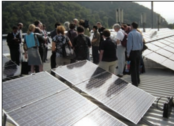
Conference delegates visit a solar installation in Freiburg

From the 13 - 15th June 2007, the City of Freiburg together with ICLEI, organised the conference 'Local Renewables 2007 - Powerful local action for secure and sustainable energy in Europe'. The Lord Mayor of ICLEI European Secretariat host city Freiburg, Dr. Dieter Salomon, invited local decision-makers and politicians, representatives from utilities, businesses and the research and development community from Europe and beyond, to jointly work on solutions for future urban development and a sustainable energy supply.