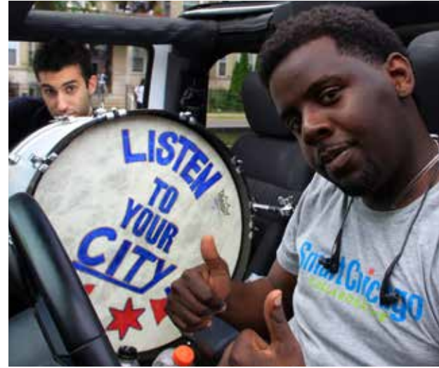
Smart Chicago at the Bud Billiken Parade 2015

field of enabling access to technology, Smart Chicago supports actors to spread technology in communities, for example through computer centres across the city. They foster digital skills for all by working with actors that provide computer skills trainings in libraries, schools or summer programs. Building on their work to enable access and foster skills, Smart Chicago aims to create meaningful content for people to work with. For example, Smart Chicago is supporting Cook County, in which Chicago is the largest city, to create and publish open data. But the collaborative does not only open up the data, it also develops apps that allow normal citizens to make use of this data. It therefore makes data more accessible. The tools and apps created by Smart Chicago are all open source.