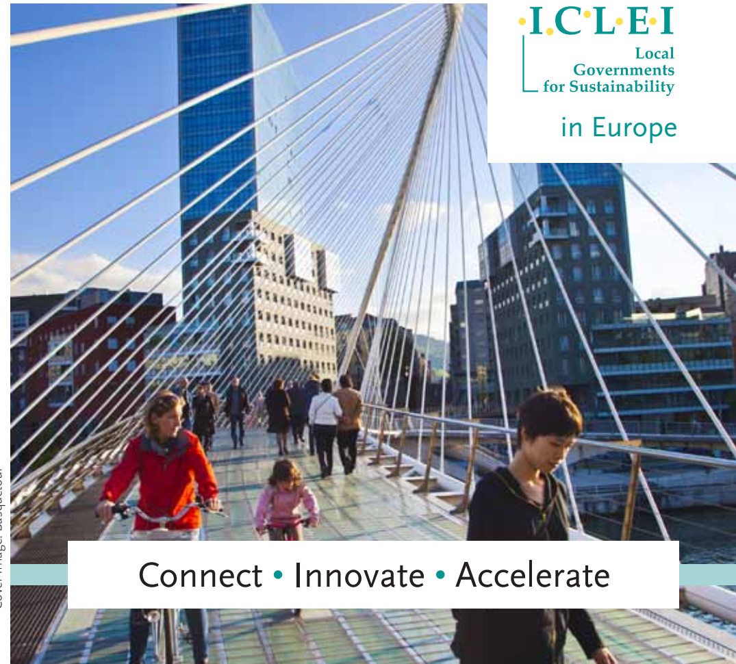
Cover Image: Basquetour

ICLEI Local Governments for Sustainability